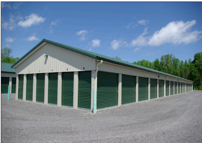
Ontario NY Storage Units Constructed by Gerber Homes & Additions www.ontarionystorage.com

The storage units consist of three different sizes and prices. Available is a 5 x 10 ft size for $60/mo.; a 10 x 10 ft. size for $70/mo.; and a 10 x 20 ft size for $90/mo. At the present time 71 units are available; however the Ontario planning board has granted final approval for another 72 units. Pending town approval, outside storage may be a consideration for the future. The units are suitable for residential and business storage. John Graziose commented that the units can be used for vehicle storage but there is no electrical in the units. Seven to eight security cameras will be installed. If you are interested in renting a unit, please contact Susan at Gerber Homes & Additions at (315) 524-8392 or e-mail susan@gerberhomes.com . Website: www.ontarionystorage.com . (The ribbon cutting ceremony is a service provided by the Ontario Chamber of Commerce.)