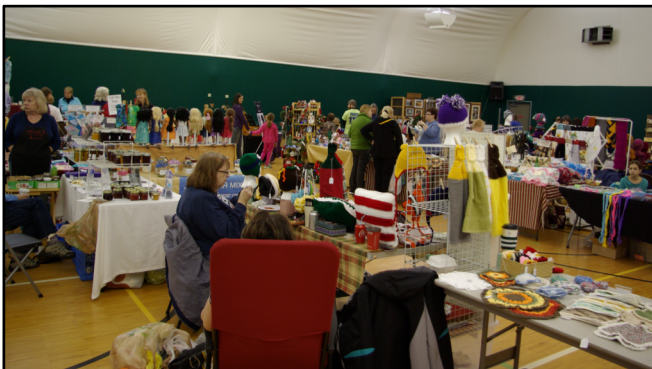
Shoppers found plenty of hand-crafted items to choose from at the Ontario Chamber's Holiday Craft Show held on Nov. 10, 2018 (more photos and story page 3)