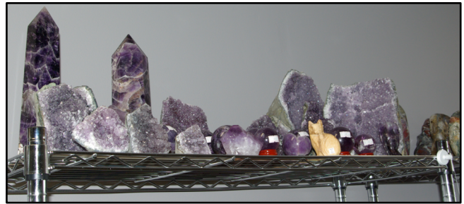
A row of amethyst items at Twisted Creations.