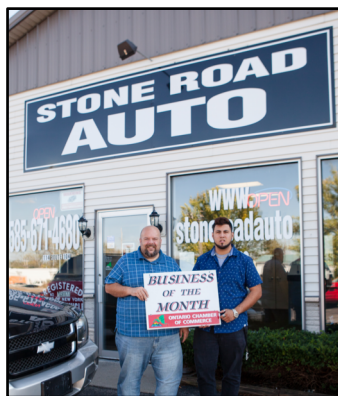
October, 2018 Business of the Month, Stone Road Auto (story on page 7)