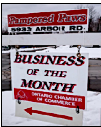
Pampered Paws – March Business of the Month Story page # 9