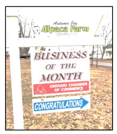
Autumn Joy Alpaca Farm - April Business of the Month Story page # 10