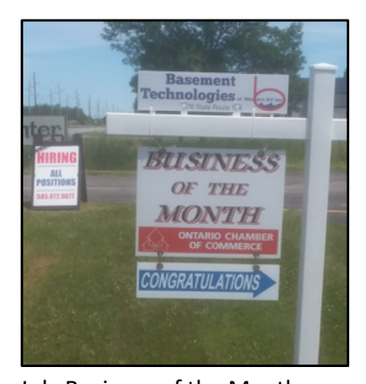
July Business of the Month Basement Technologies of WNY 476 NYS Rt. 104 Story pg. #7