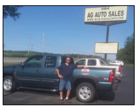
August Business of the Month AG Auto Sales, 584 NYS Rt. 104 Story pg. #8