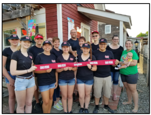
Mimi and Papa's Ice Cream and Treats Opens - Knickerbocker Rd., next to Heintzelman's BBQ Pit Story pg. #6