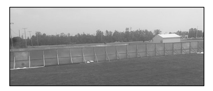
2019 County and New York State Fair Information

Pictured below is a temporary water storage facility under construction at the Ontario Firemen's Exempt Field on Route 104 which will be used in conjunction with the Ontario water tank repairs. For more information contact the Town Supervisor, Frank Robusto at 315-524-7015, or email supervisor@ontariotown.org.