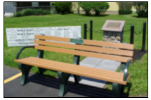
A Tribute Bench is now located at the American Legion Post #428 at 6180 Knickerbocker Rd.

This is a new program by the Ontario Chamber that allows a partnership with the chamber and a family/individual, business, or organization to purchase a Tribute, Park-style Bench. The benches will be located in public places within the Town of Ontario and include a raised historical-type marker recognizing an individual/business/organization. The chamber is working with the Town Parks & Recreation Department with this program.