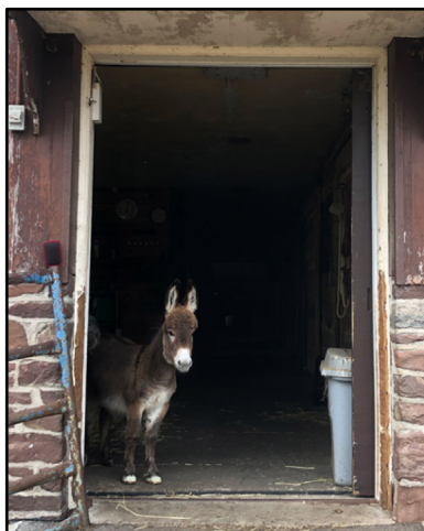
Ontario Donkey Gets Corrective Shoes Story Pg. #8