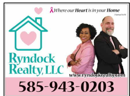
Ryndock Realty, 1250 NYS Rt. 104, March, Business of the Month Story Pg. #11