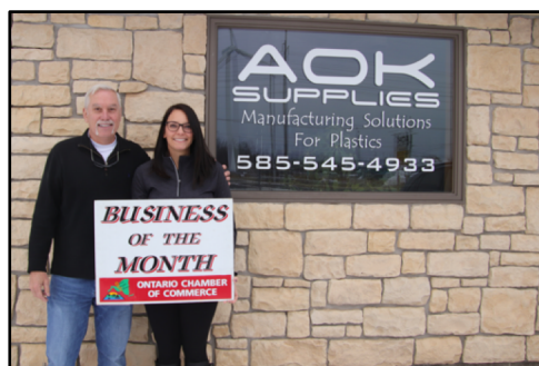
AOK Supplies, 369 NYS Rt. 104 February, Business of the Month Story Pg. #10