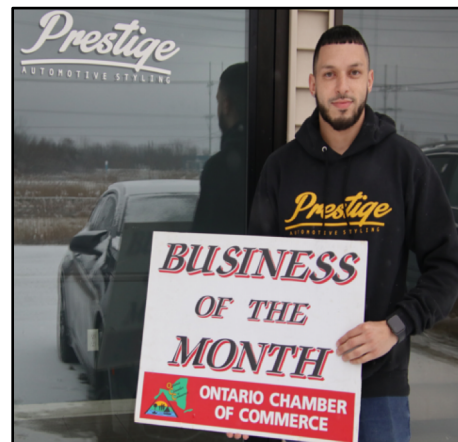
Prestige Automotive Styling, 396 Rt. 104, January, 2021, Business of the Month