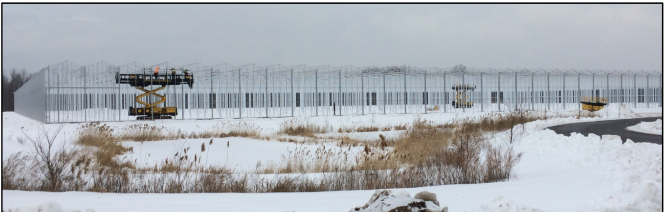
Work continues at Intergrow Greenhouses through the winter months (photo Feb. 2021)

Intergrow Greenhouses offers a variety of locally grown greenhouse tomatoes from cherry, grape, medley mix, to beefsteak and more. They are available year-round at Walmart, Tops Markets, & Aldi's supermarkets. Intergrow prides it self in harvesting, picking, packing, and transporting tomatoes in their own climate controlled trucks within 24 hours to their customers. Intergrow Greenhouses, Inc. began in 1998 and has another facility located in Albion, New York.