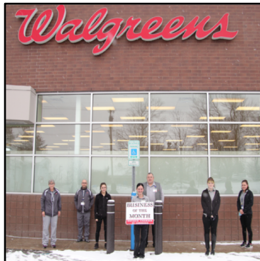
Walgreens, 6296 Ontario Ctr. Rd., March, Business of the Month Story page #6