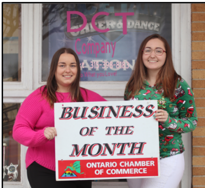
Dance, Cheer, Tumble, 2013 Ridge Rd., February, Business of the Month Story page # 5