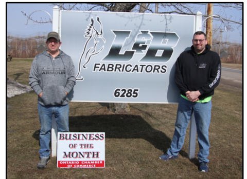
L & B Fabricators, 6285 Dean Parkway April, Business of the Month Story page #7