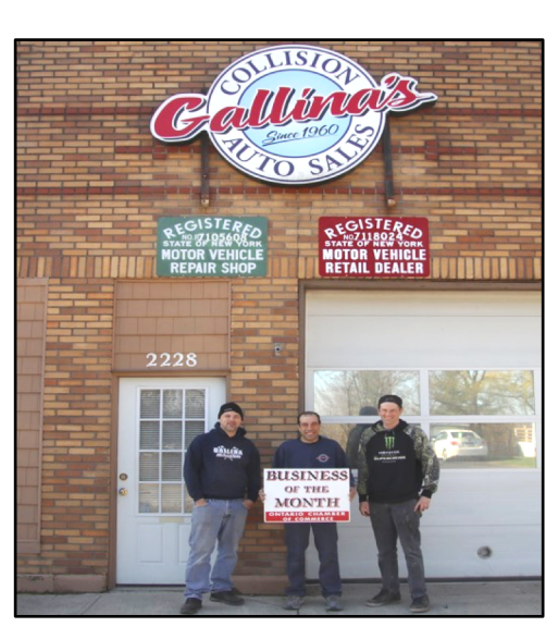
GALLINA'S COLLISION May, 2021 Business of the Month (Story pg. # 7)