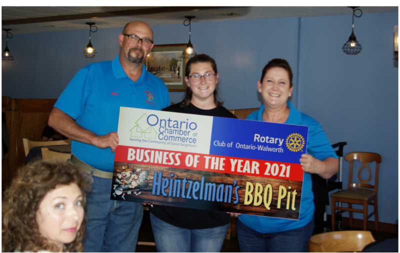
HEINTZELMAN'S BBQ PIT Receives Business of the Year Award (Story pg. # 3)