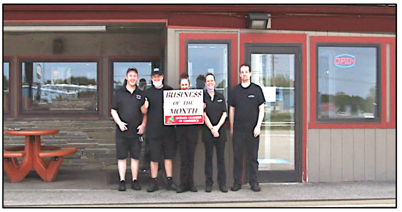
BILL GRAY'S RESTAURANT & TAP ROOM June, 2021 Business of the Month (Story pg. #8)