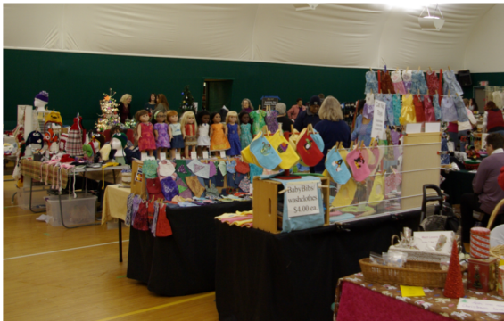
Photos from the Chamber Craft Show 2018