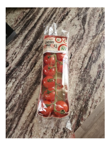
Look for Intergrow tomatoes at Aldi's; Walmart; Tops; & Hannaford