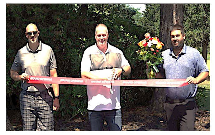
Ontario Golf Course & Pub 235 On The Green Celebrate Grand-Opening, Story page # 4