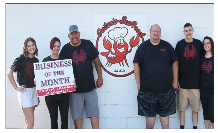
August, 2022 Ontario Chamber Business of the Month – Ontario Seafood - Story page # 6