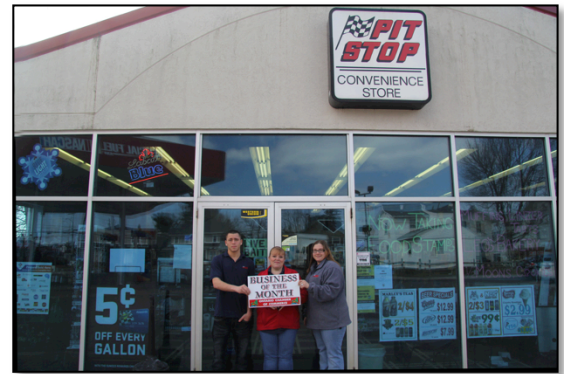
1530 Ridge Rd., Ontario Ctr.