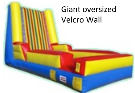
Giant oversized Velcro Wall