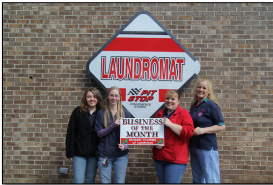
2007 Rt. 104, Ontario