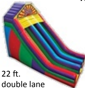
22 ft. double lane slide. Water slides are also available

Pictured below are some of the inflatables available from Adventures In Climbing. Welcome to our business community!