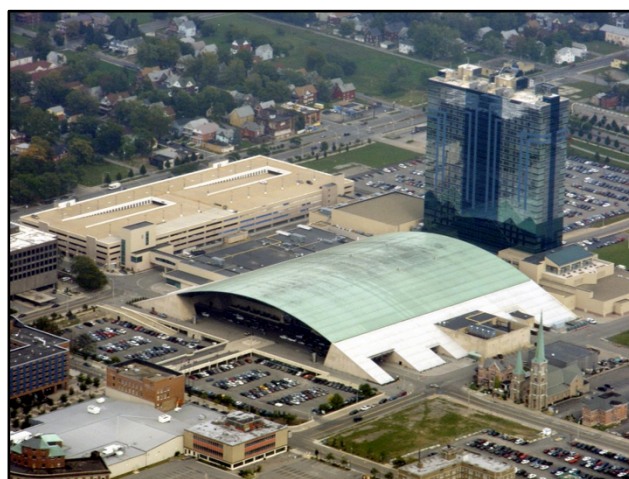
Seneca Niagara Casino, Niagara Falls, NY