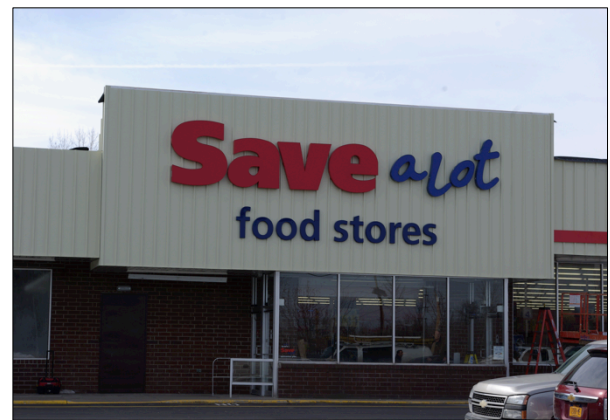
Ontario Plaza – 1250 Rt. 104, Ontario, NY

Save-A-Lot is the second anchor store to occupy square footage as part of the rejuvenation of the Ontario Plaza, (formerly Ames Plaza). Big Lots opened a location in the plaza in November, 2012. Other improvements include a complete re-pavement and marking of the parking lot and a facelift to the building façade.