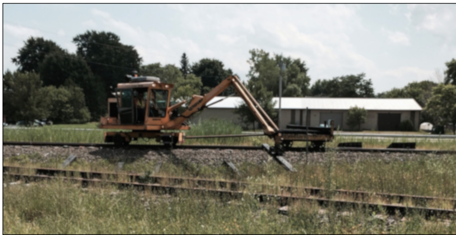
Riegel Rail Solutions machinery at work in Ontario, near Harbec Plastics, replacing railroad ties, August, 2014