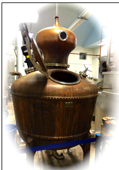
Pictured above, copper still at Apple Country Spirits