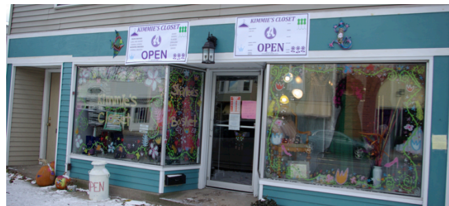
Store Front of Kimmie's Closet 1998 Ridge Rd., Ontario, NY

The ribbon cutting ceremony is a service provided by the Ontario Chamber of Commerce. To learn more about our benefits and services contact the chamber at 315-524-5886 or go to our website: www.ontarionychamber.org .