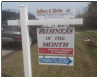
Jeffers & Birnie, CPA MAY Ontario Chamber Business of the Month Story Page #11