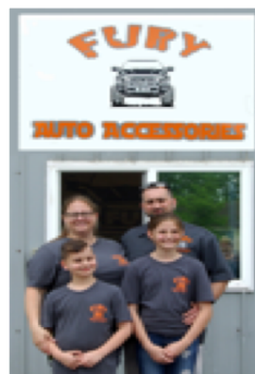
Fury Auto Accessories Opens – Story Page #4