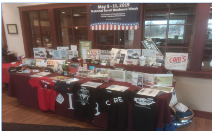
2019 Display in the lobby at Lyons National Bank, Tops Plaza