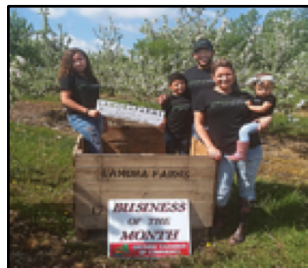
LaMora Farms, JUNE Ontario Chamber Business of the Month Story Page #12