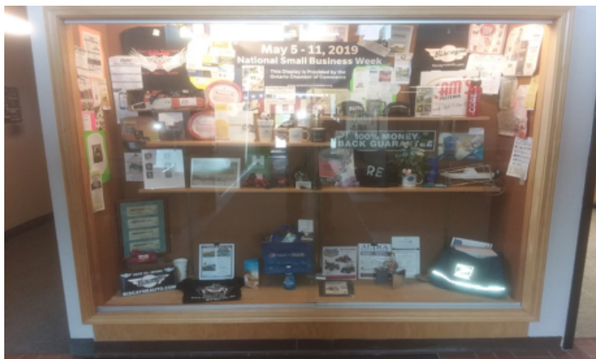
2019 Display at Ontario Town Hall/Library Lobby

As we return items loaned for the displays and remove display materials, we wish to extend a sincere "thank you" to you and over 100 local business for participating !! We look forward to including you in our displays in the Spring of 2020 !!