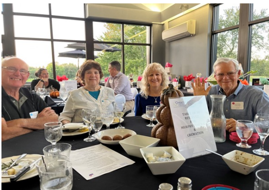
Some folks from Murphy Funeral & Cremation Chapels