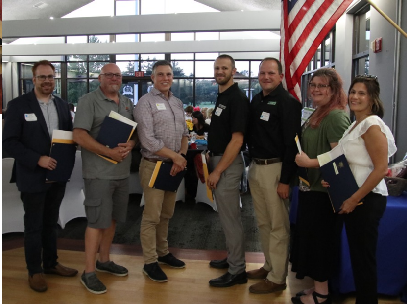
Group photo of the Businesses of the Month that attended the banquet: :