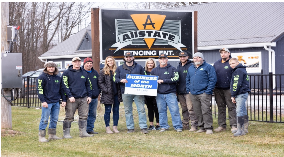
All State Fencing's Team – December Business of the Month