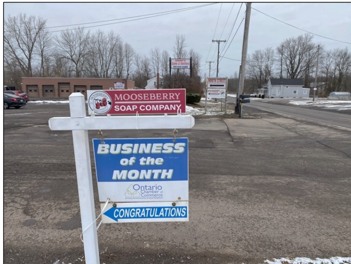
Mooseberry Soap Company, 6341 Ontario Center Rd. Bldg. 9, February, 2024

Ontario Chamber Business of the Month (story pg. 2)