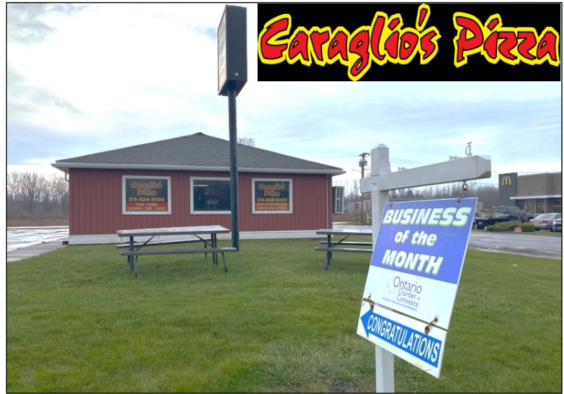
Caraglio's Pizza, 1208 NYS Rt. 104, January 2024

Sylvia Ryndock – term expires 2026 Ryndock Realty