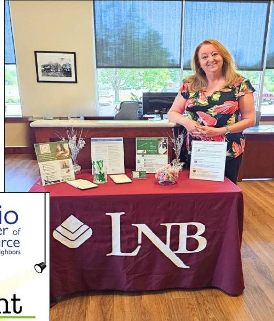
Story Page #2