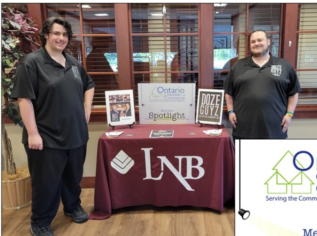
Story Page #2