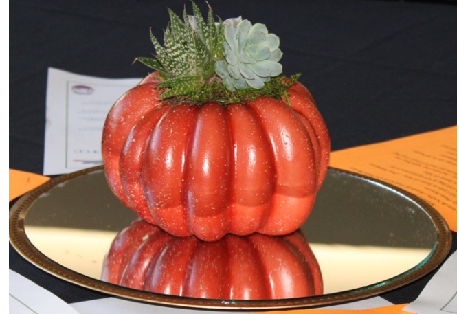
Centerpieces of pumpkins and succulents were donated by Edler Acres in Ontario, NY