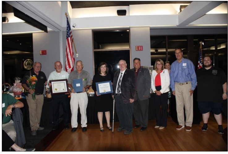
The Ontario Food Pantry, Community Organization of the Year

Business of the Year : Save-a-Lot, co-sponsored by the Ontario-Walworth Rotary Club and the Ontario Chamber of Commerce.